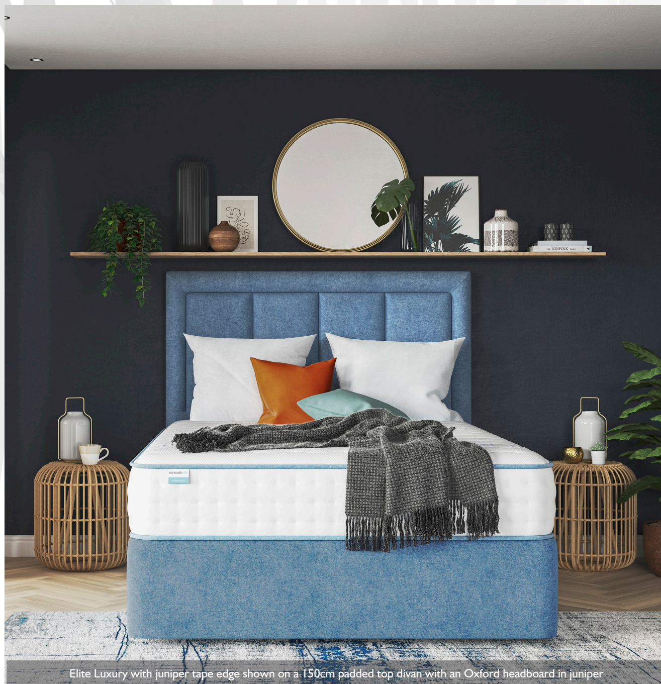
Elite Luxury with juniper tape edge shown on a 150cm padded top divan with an Oxford headboard in juniper

An internally tufted design for a modern, clean, contemporary look.