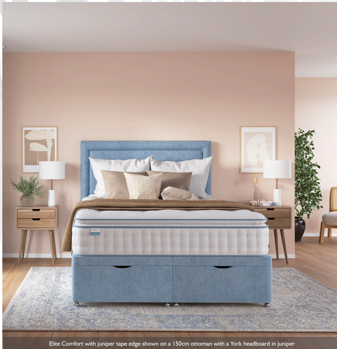
Elite Comfort with juniper tape edge shown on a 150cm ottoman with a York headboard in juniper

A lofty pillowtop mattress with a cushioned layer of comfort and support.