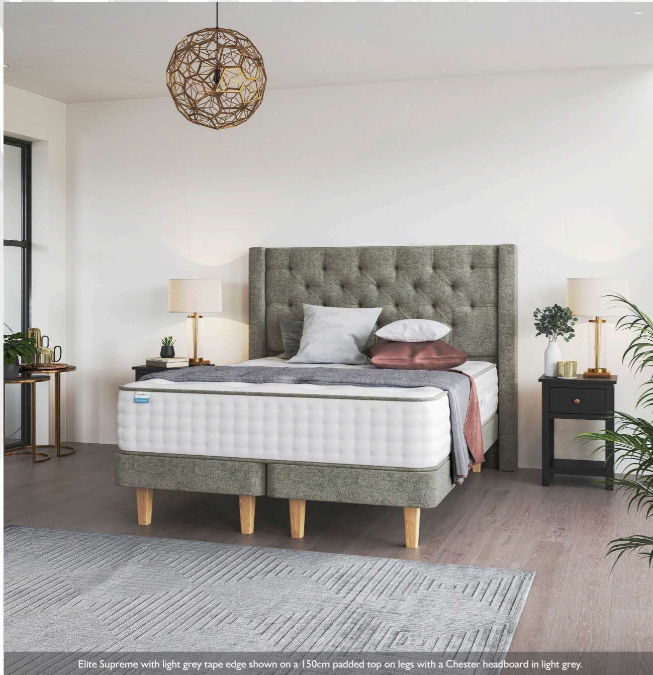
Elite Supreme with light grey tape edge shown on a 150cm padded top on legs with a Chester headboard in light grey.

A classically styled tufted mattress featuring sumptuous natural fillings, giving you the most luxurious night's sleep.